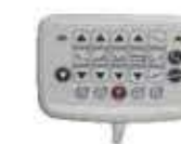
Attendant Control Panel