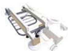
Pull-out Linen Holder and Bed Extension