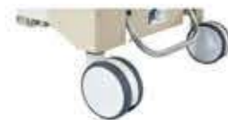
Central Locking Castors with Directional Lock and Brake Mechanism Lever