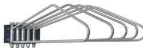
Wall Mounted Apron Hanger