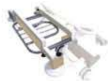
Pull-out Linen Holder and Bed Extension