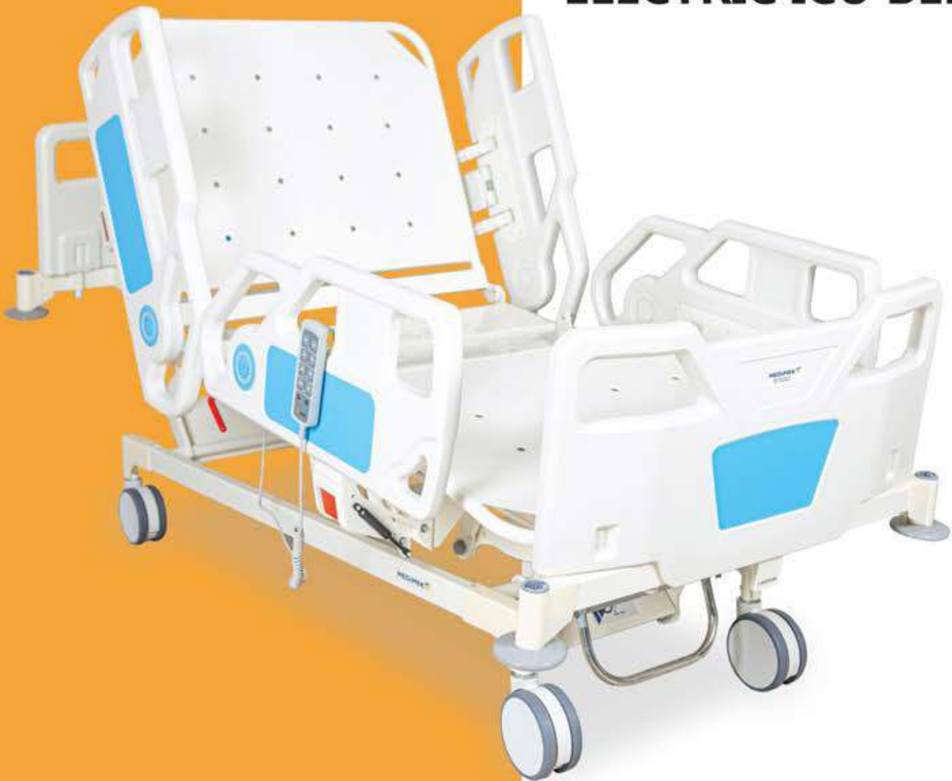
Mi-9005 A Electric ICU Bed with Patient Handset and Central Locking Castors