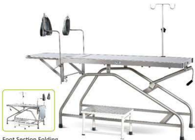
Foot Section Folding