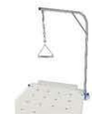
Lifting Pole - SS